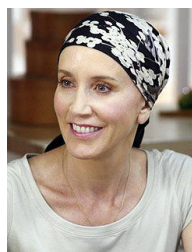
A Desperate Housewives storyline about Lynette Scavo focused on her diagnosis with cancer.